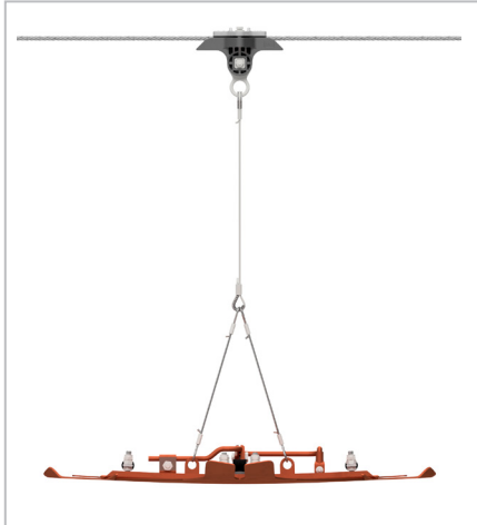
On the cross span (steel or synthetic rope)

For further recommendations see our assembly instructions. The suspension must be ordered separately to the KUDISC.